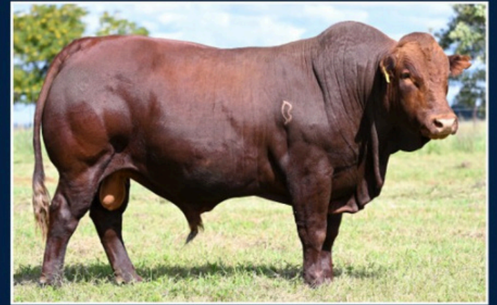
LOT 5 - HOT23-049