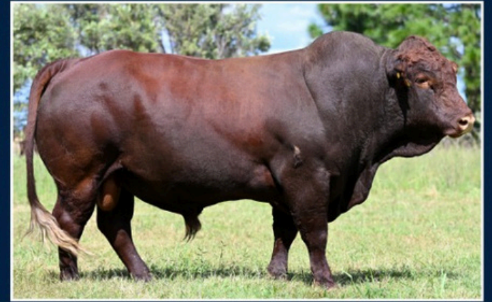
LOT 16 - HOT22-099