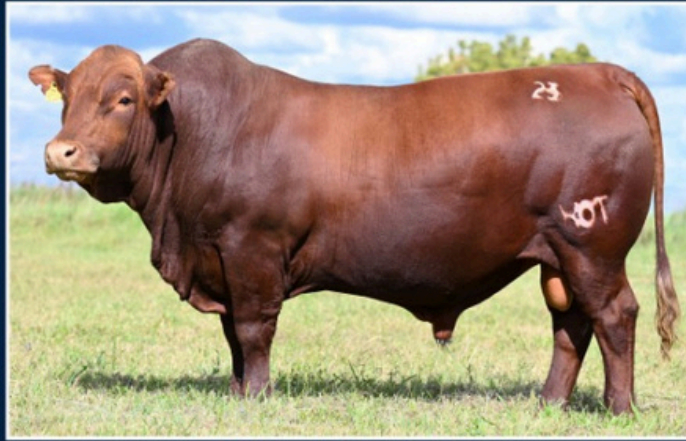
LOT 8 - HOT23-047