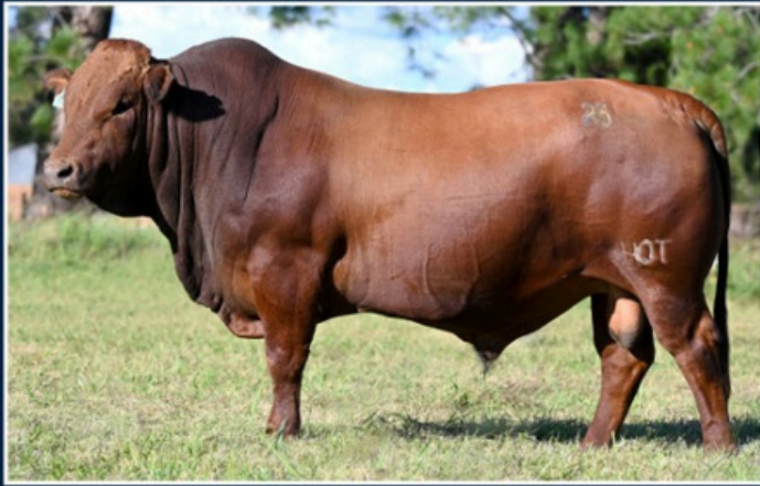
LOT 1 - HOT23-037