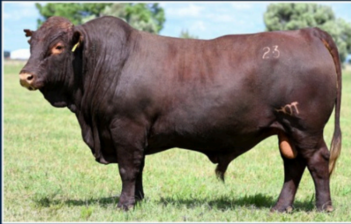
LOT 6 - HOT23-068