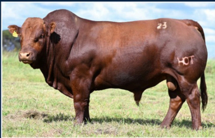
LOT 12 - HOT23-059