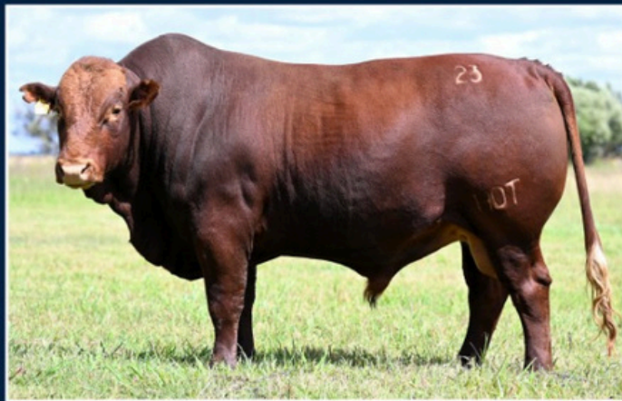
LOT 2 - HOT23-082