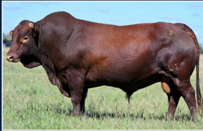
LOT 7 - HOT22-041