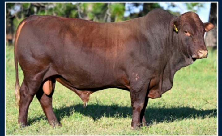
LOT 4 - HOT23-080